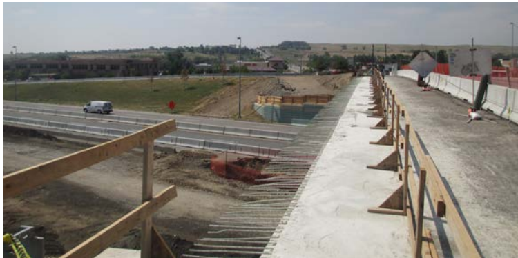
Bridge construction: 60 percent complete