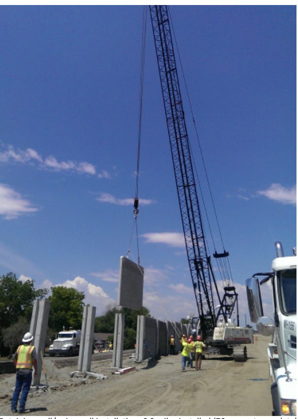
Retaining wall/noise wall installation: 6.9 miles installed (70 percent complete