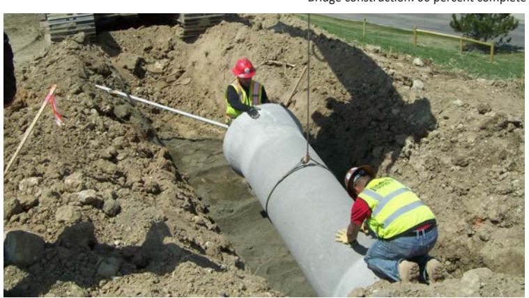
Pipe installation: 12.75 miles laid (75 percent complete)